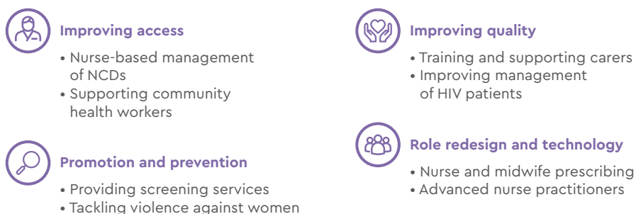
Figure 6. New and innovative services

Nurses and midwives are playing a leading role in many new and innovative services, all of which show what can be achieved in the future. These examples fall loosely into the four groups shown in Figure 6: improving access; promotion and prevention; improving quality; and role redesign and technology.