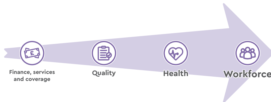
Figure 2. The evolution of UHC policy

This model does not, however, describe what UHC looks like in practice – the shape, profile and quality of services needed, for example – or how to get there. This will be different in every country, depending on disease burden, age profile, history, geography and socioeconomic factors.