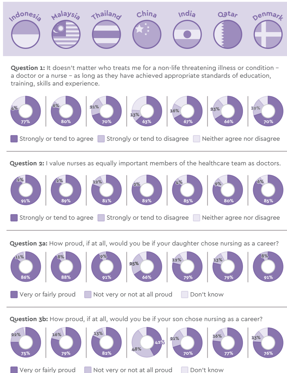
Figure 5. Survey of public perspectives on nursing

The survey is analyzed in more detail in Appendix 1, which considers the differences between countries and age groups.