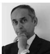
Professor the Lord Darzi of Denham, OM, KBE, PC, FRS Executive Chair, WISH, Qatar Foundation Director, Institute of Global Health Innovation, Imperial College London

This report concludes with a clear plan of the practical steps that need to be taken in every country that aspires to introduce, develop or sustain UHC for all its citizens.