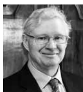
Lord Nigel Crisp KCB Co-Chair, Nursing Now Co-Chair All-Party Parliamentary Group on Global Health, House of Lords