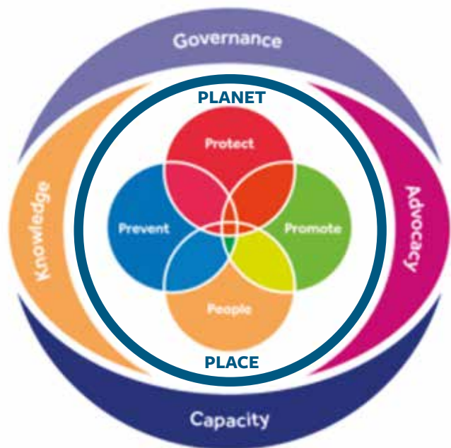
Applying a One Health multi-sector systems approach and building on the Global Charter for the Public's Health