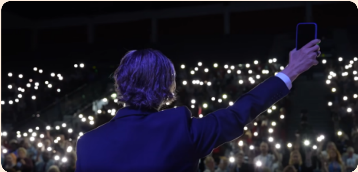
ICN CEO Howard Catton stood alongside nurses from around the world at the ICN Congress 2025, showing solidarity with colleagues affected by war, conflict and disaster.