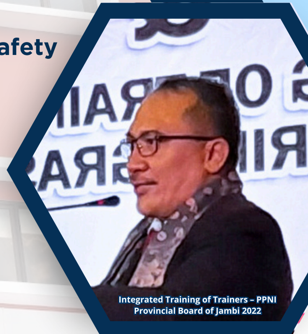
Integrated Training of Trainers – PPNI Provincial Board of Jambi 2022