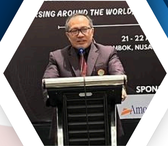
The 8th WANS in Conjunction With The 5th ICINNA - 2024 in Lombok, West Nusa Tenggara