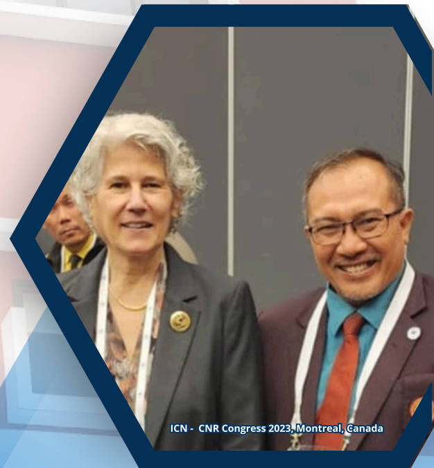
ICN - CNR Congress 2023, Montreal, Canada