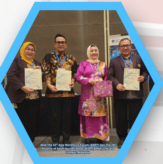
2024 The 22 nd Asia Workforce Forum (AWFF) dan The 18 th Alliance of Asian Nurses' Association (AANA) in Kuala Lumpur, Malaysia