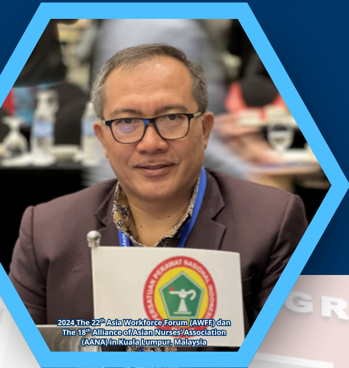
2024 The 22 nd Asia Workforce Forum (AWFF) dan The 18 th Alliance of Asian Nurses' Association (AANA) in Kuala Lumpur, Malaysia