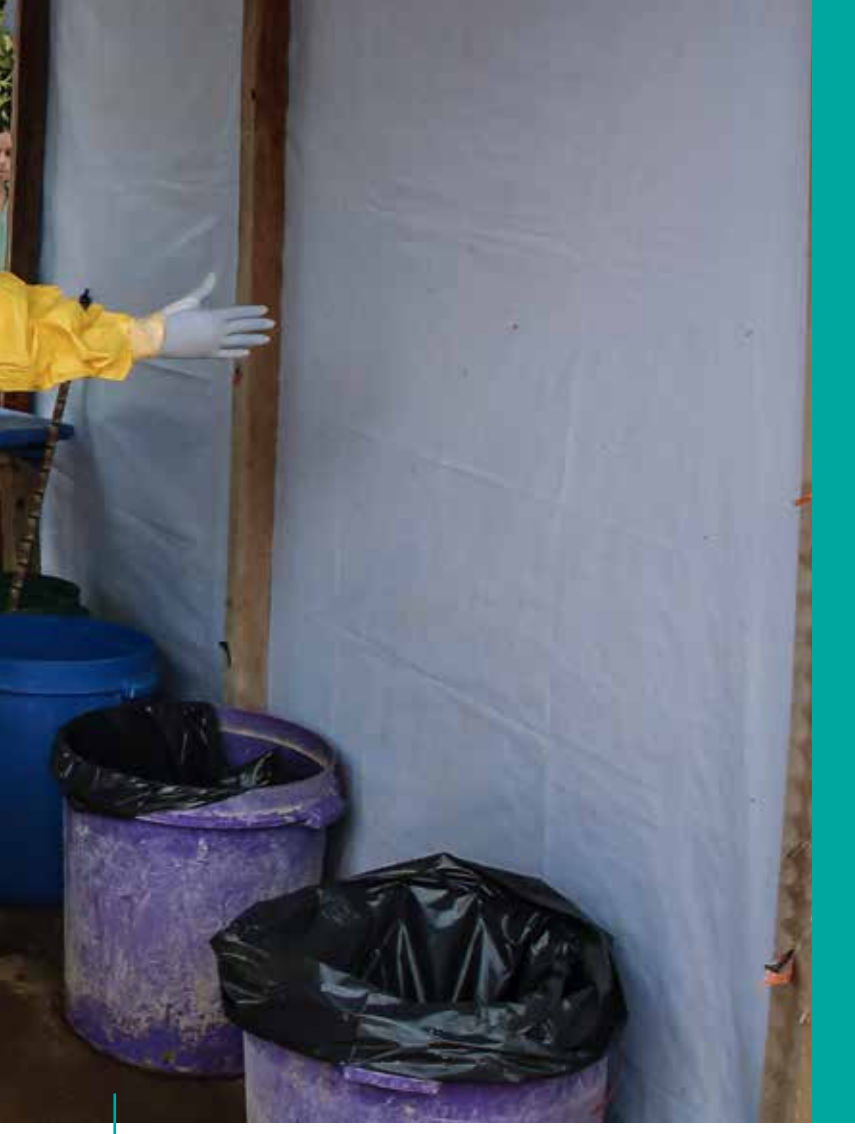
Ebola response in Mangina, Democratic Republic of Congo.