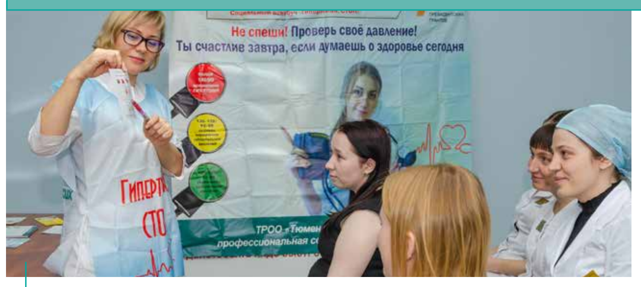
Tyumen Regional Nurses Association, Russia.