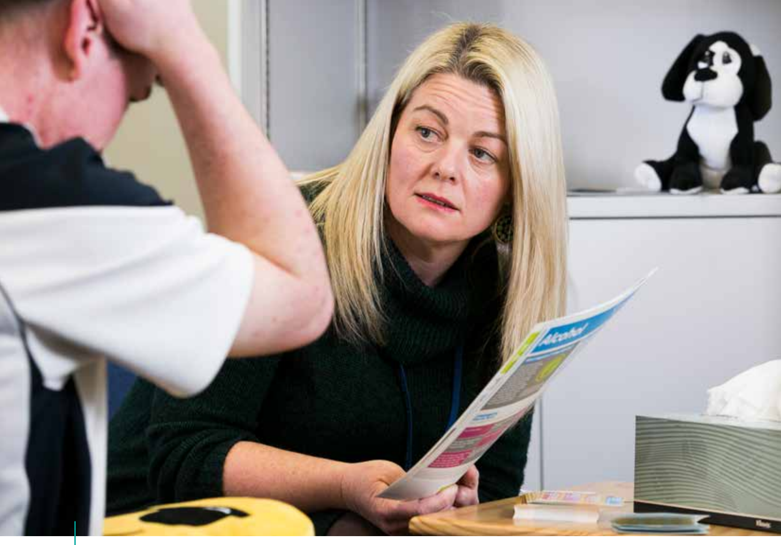
Child and Adolescent Health Service, Western Australia.