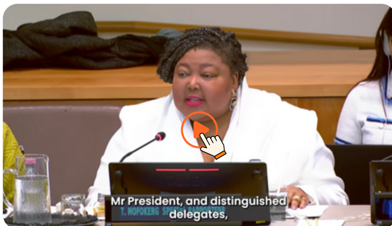
UN Special Rapporteur for the Right to Health recognizes ICN's #NursesforPeace campaign.

ICN's #NursesforPeace campaign was recognized by the UN Special Rapporteur for the Right to Health as an example of good practice in providing "essential humanitarian resources, mental health support, and emergency preparedness and leadership training". This was in the report "Health and care workers: the oath takers and defenders of the right to health" presented to the UN General Assembly.